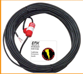
PR-XX (lite preformed loop with lightning protection)